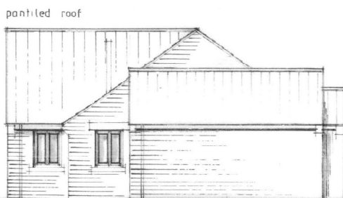
s o u t h e a s t

THIS COPY HAS BEEN MADE BY OR WITH THE AUTHORITY OF RYEDALE DISTRICT COUNCIL PURSUANT TO SECTION 40 OF THE COPYRIGHT DESIGNS AND PATENTS ACT 1988. UNLESS THAT ACT PROVIDES A RELEVANT EXCEPTION TO COPYRIGHT, THE COPY MUST NOT BE COPIED WITHOUT THE PRIOR PERMISSION OF THE COPYRIGHT OWNER.