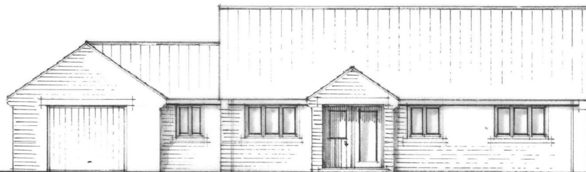
n o r t h e a s t